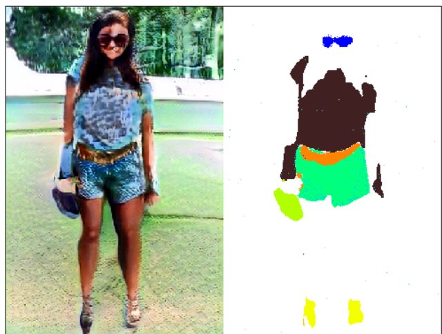
Figure 1: Sample image with segmentation map generated using the proposed method. The normal colour channels are displayed to the left, while the generated corresponding semantic segmentation maps are displayed to the right.

In this paper, we model the joint probability of images together with their semantic segmentation maps. To this end, we propose a generative adversarial network (GAN) [1], based on the Style-GAN architecture [12]. In contrast to previous GAN-based approaches, the proposed model is designed to produce samples with one output channel per segmentation class in addition to the standard three colour channels. A sample image with segmentation maps generated with the proposed method can be seen in figure 1.