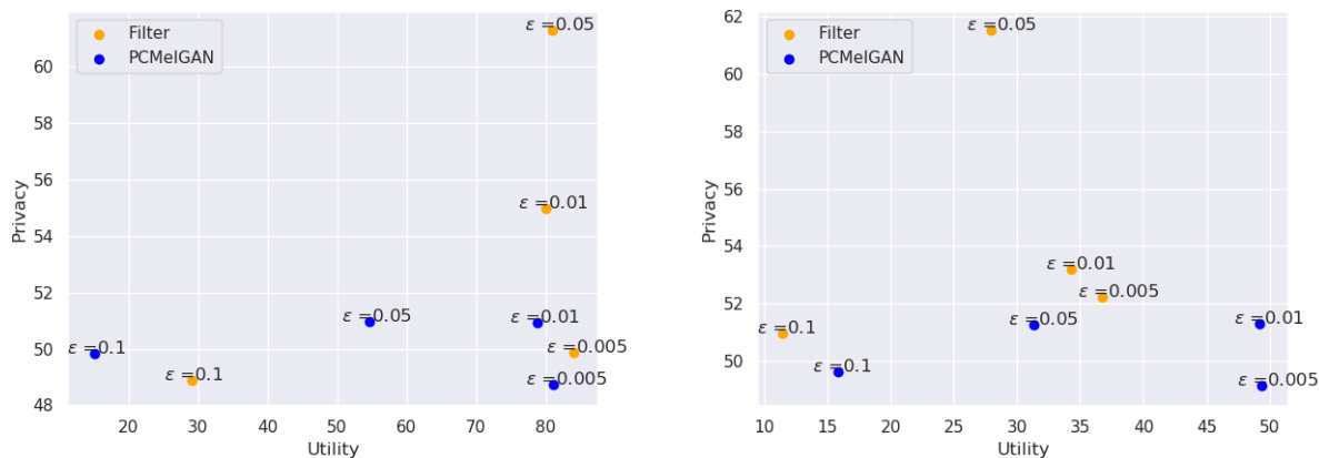
Figure 2. Privacy vs utility trade-off for the baseline and PCMeiGAN for varying \epsilon . Orange and blue points correspond to evaluating the fixed classifiers for digits and gender on the spectrogram datasets \mathcal{M}'_{test} and \mathcal{M}''_{test} (left), and raw waveform datasets \mathcal{X}'_{test} and \mathcal{X}''_{test} (right).